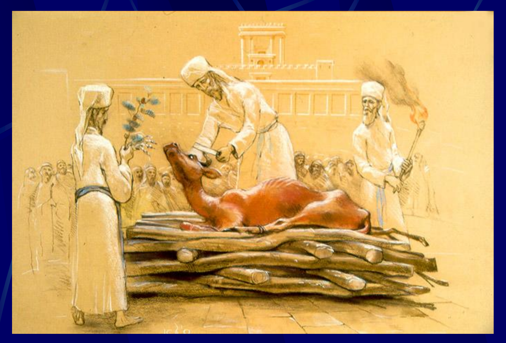
High Priest killing the Red Heifer outside the camp