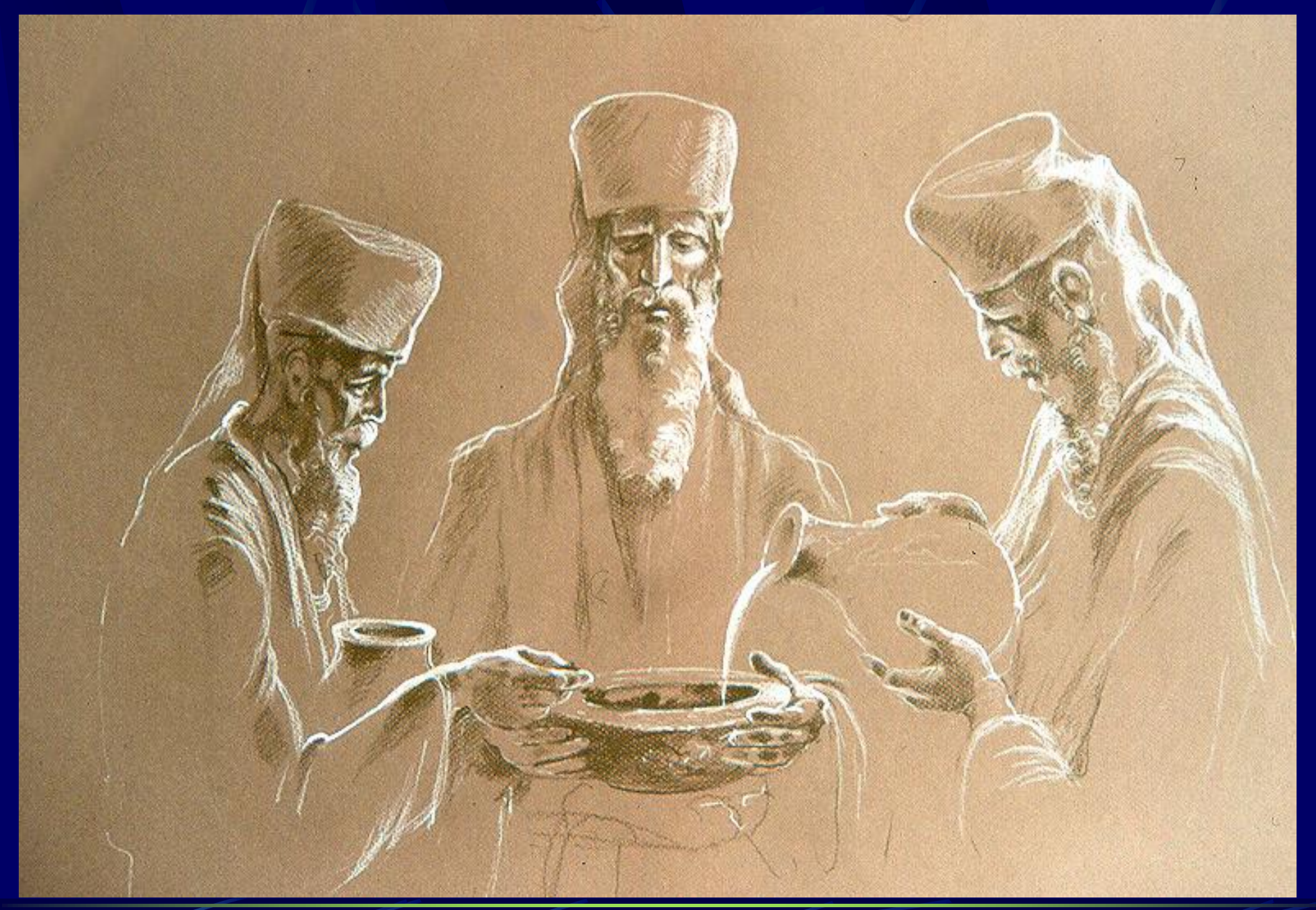
Kohen HaGadol preparing the waters of Purification