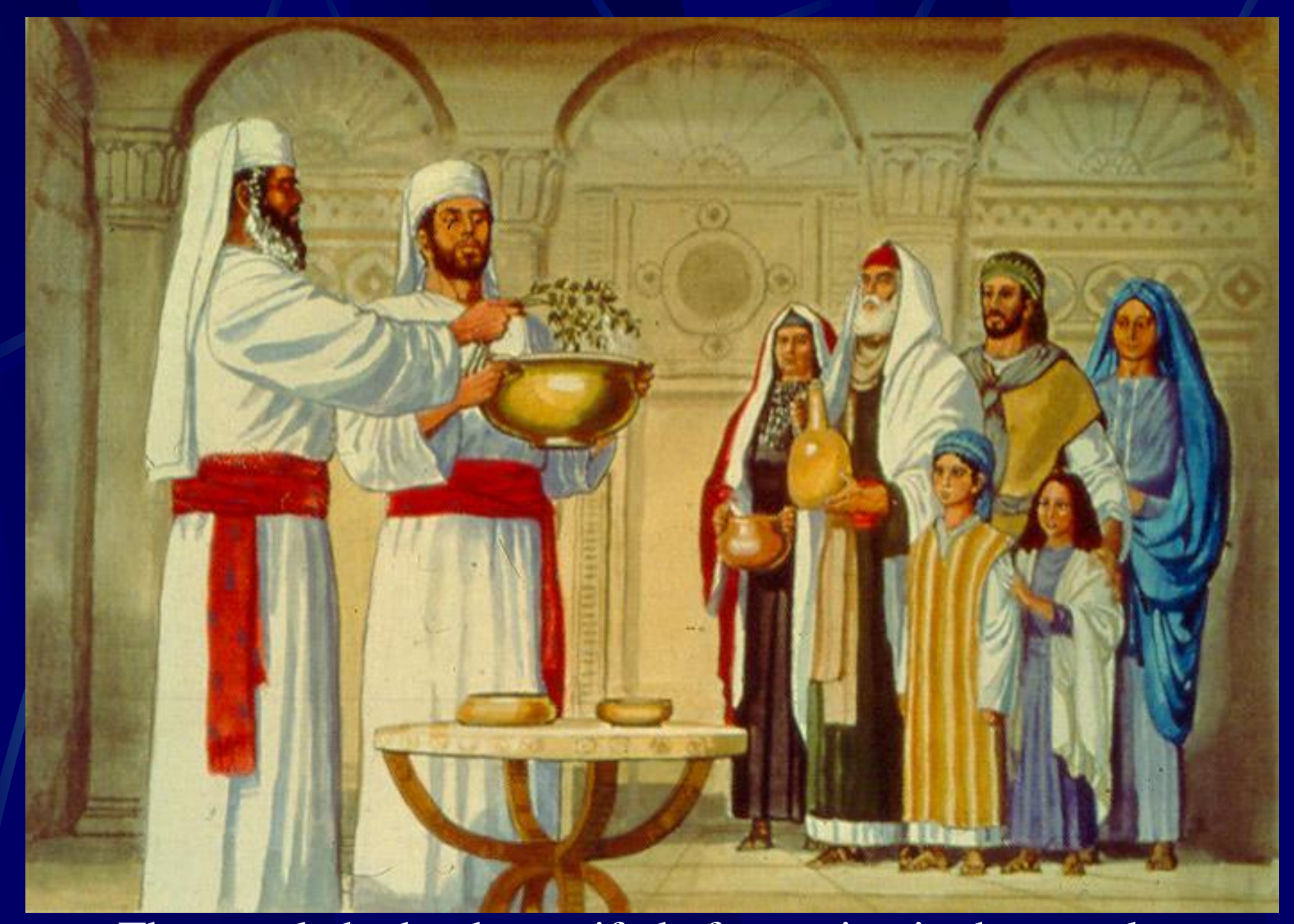
The people had to be purify before going in the temple to worship YHVH