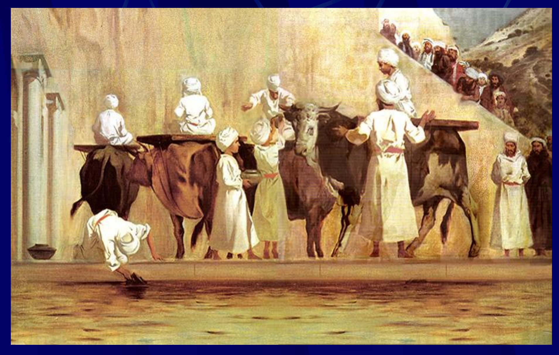
GOING DOWN TO THE POOL OF SILOAM TO GATHER WATER FOR THE RITUAL